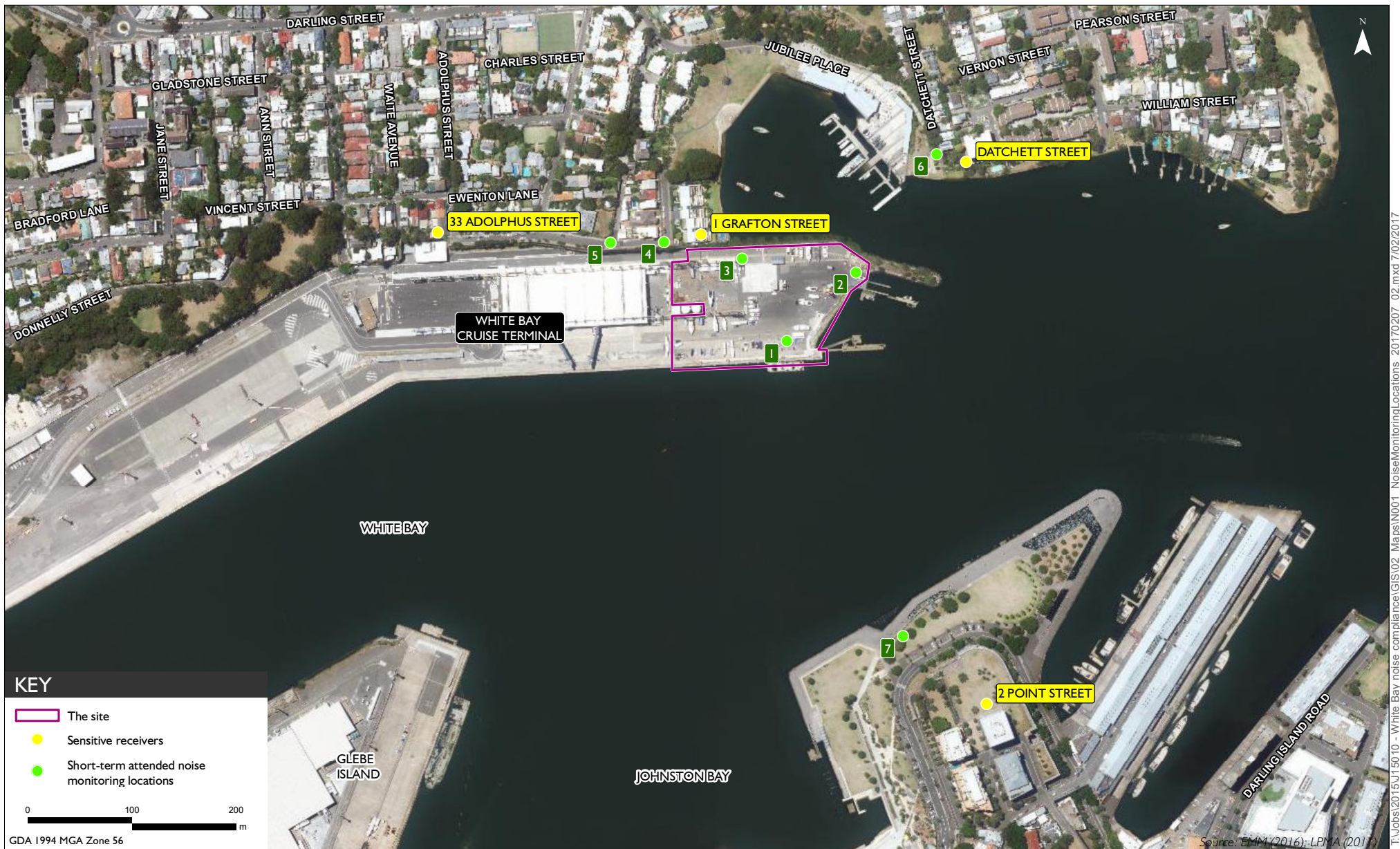
Site locality and noise monitoring locations